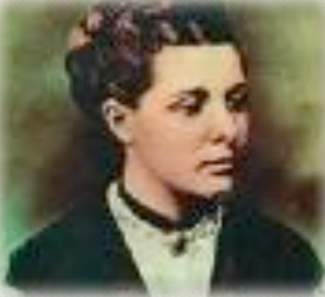
ANNIE BESANT WAS A BRITISH SOCIAL REFORMER, CAMPAIGNER FOR WOMEN'S RIGHTS AND A SUPPORTER OF INDIAN NATIONALISM